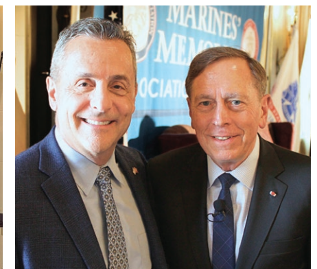
We appreciate General David Petraeus' contribution to the Comprehensive Campaign.