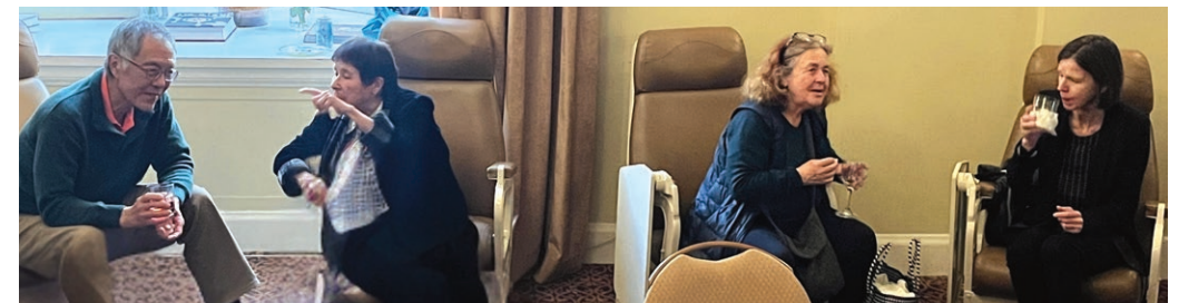
These chairs came from the Ready Room of the USS Bonhomme Richard.